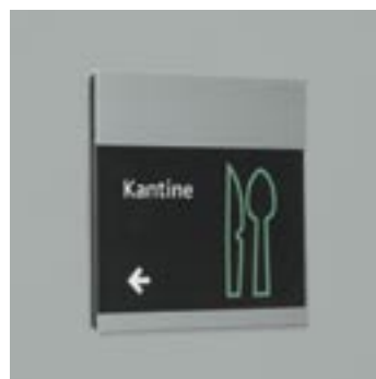
A5 Paperflex sign