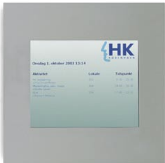
Electronic information sign