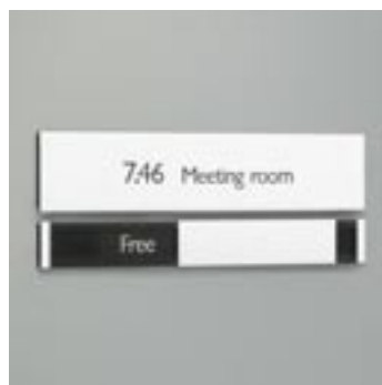
Meeting room signs