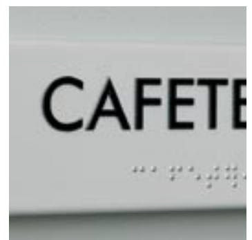
Wall sign with Braille