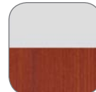
Silver Base (S) Cherry Top (CH)