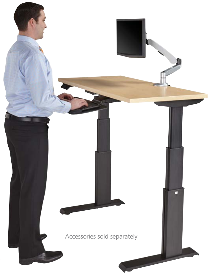
Accessories sold separately