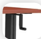
Hideaway Handle May be Mounted Left or Right Standard is Right Side