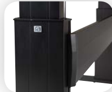
Optional cross support available