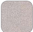
Gray Matrix (GM)*