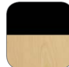
Black Base (B) Hardrock Maple Top (HM)