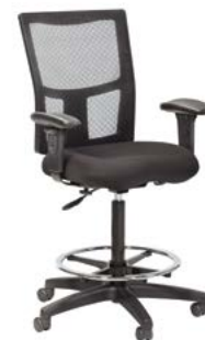
CT3050 Mesh Back Stool with CT3ARMS