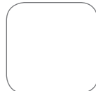
Galaxy White (GW)

*Chocolate Flame and Gray Matrix have Black edge banding