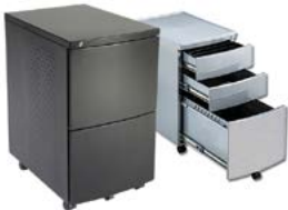
Mobile Pedestal 500MP and 502MP