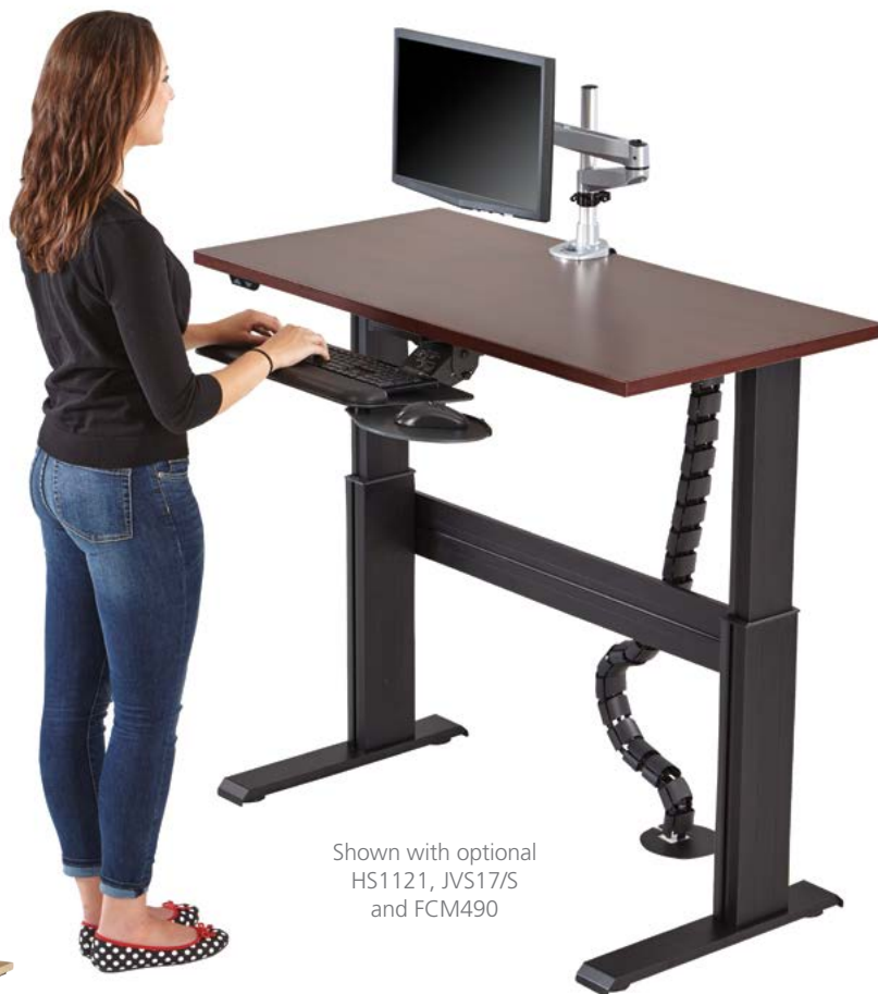
Shown with optional HS1121, JVS17/S and FCM490