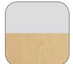
Silver Base (S) Hardrock Maple Top (HM)