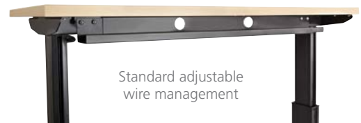
Standard adjustable wire management