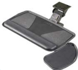
Myriad™ with FastAction Precision Arm MFP21