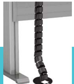
Flex Wire Management FCM490