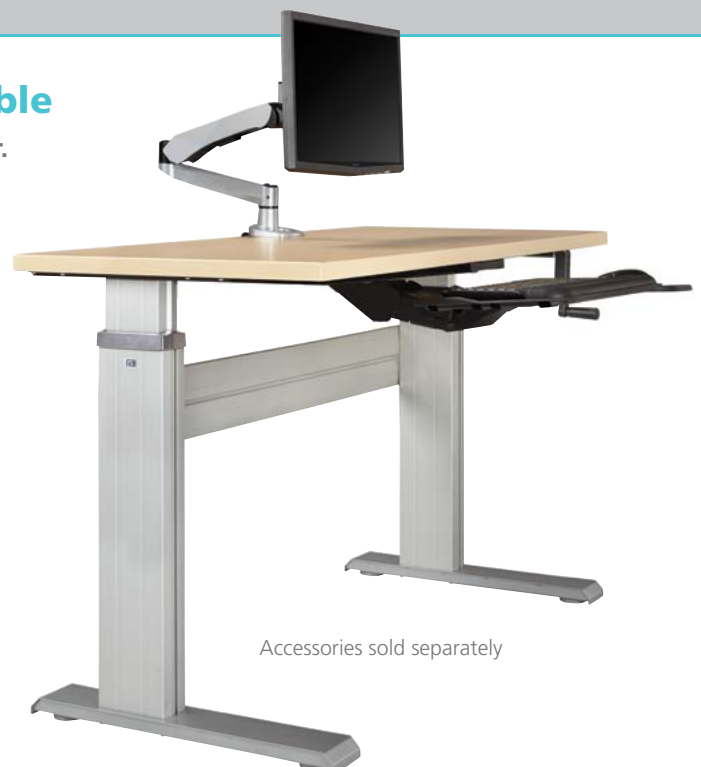
Accessories sold separately