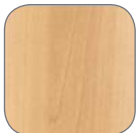
Hardrock Maple (HM)