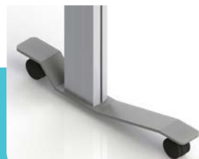
Caster Foot add - C to item number