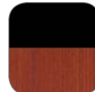
Black Base (B) Cherry Top (CH)

(Only Available on Standard 24" Configurations)