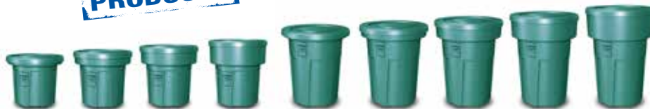
9 Sizes: From 20 Gallon to 55 Gallon