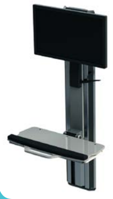
Hover WM Slim HWMWSW