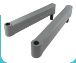
16" Extension Arm