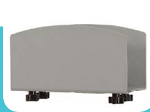
Track CPU Cradle