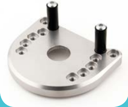
Steel Pivot Limiter