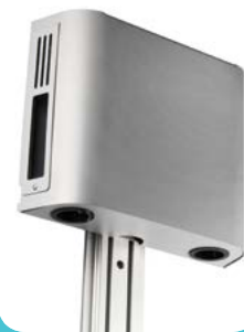
Enclosed CPU Track Mount