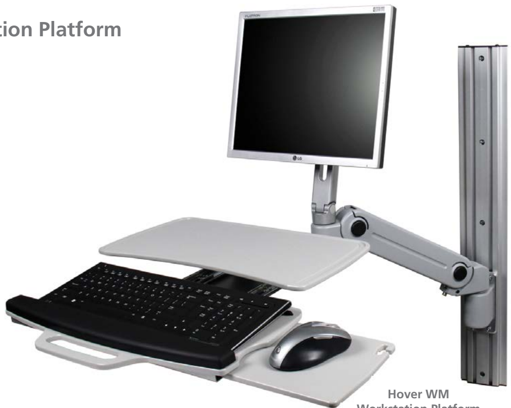
Hover WM Workstation Platform HWM48 & HWM32